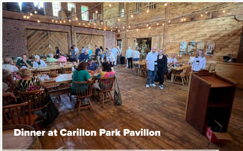
Dinner at Carillon Park Pavillon